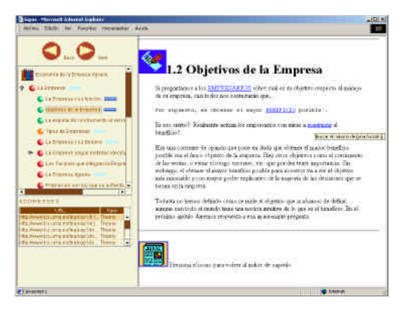
Fig. 3 Example of the student's interface of SIGUE for TEA.

HTML document associated with the concept and the activated link of recommended concepts and glossary terms (in this case activated by a hint).