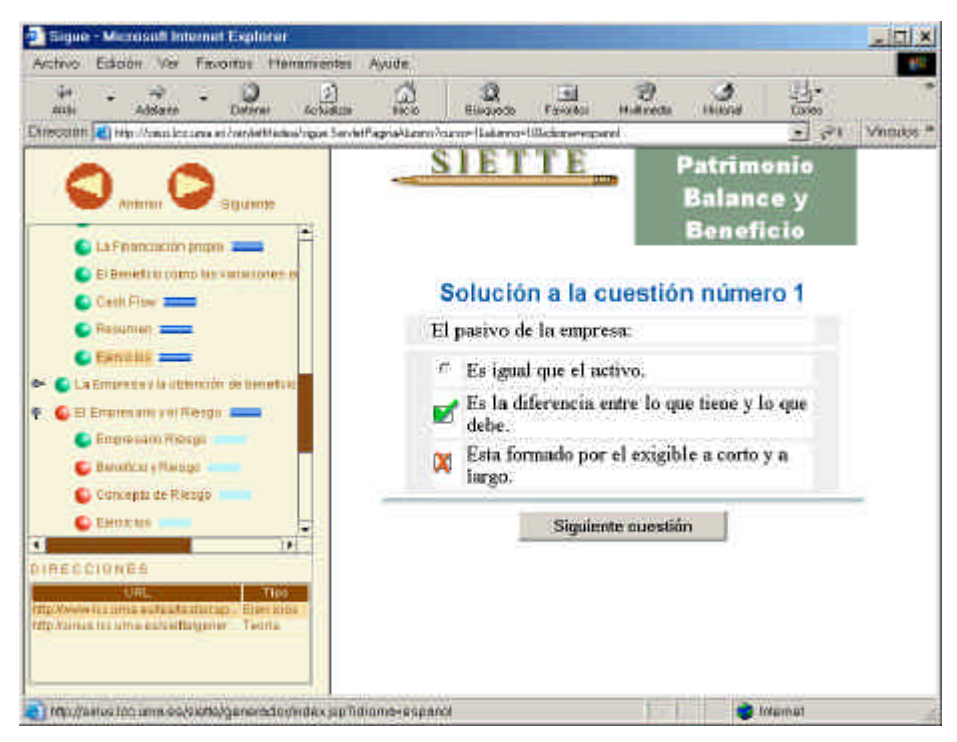
Fig. 6. Integration of SIETTE and SIGUE.