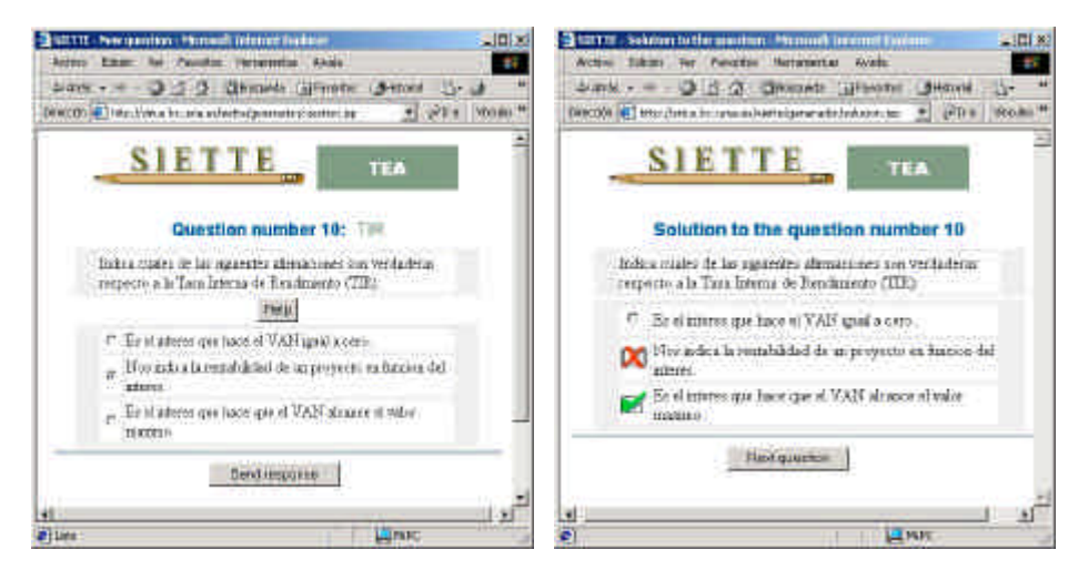
Fig. 4. An item posed by the test generator and its correction.

All tests have been defined for twelve knowledge levels. Therefore, at the end, the system will give a qualification between 0 and 11. All items are multiple choice items, i.e. , items where students may either select only one response of a set of options, or not select anyone.