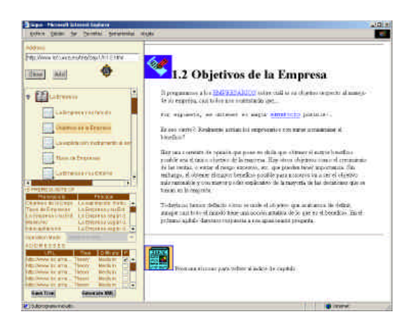
Fig. 1. The interface of SIGUEAUTOR .

To construct an adaptive course, it is necessary to define the prerequisite relationship of the concepts. This definition must be as complete as possible. This will be used to guide the student correctly in the sequence of concepts to visit, establishing a partial order for the learning process.